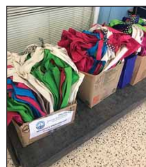
Donated PJ Library books and bags for Sterling and Huntingtowne.

This past January was our opportunity to make a difference, but also bring attention to an educational crisis right here in our beloved Queen City, and also across the state and throughout the country. Today, only 39% of Charlotte's 3rd graders are reading at grade level. Thirty-nine percent! Third grade reading proficiency is a super strong indicator of high school graduation rates, with a staggering 96% graduating on